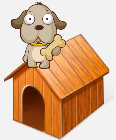
The dog is ON the dog house