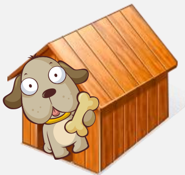
The dog is IN the dog house