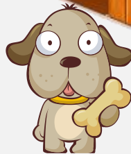
The dog is in FRONT OF the dog house