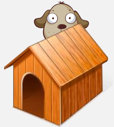
The dog is BEHIND the dog house